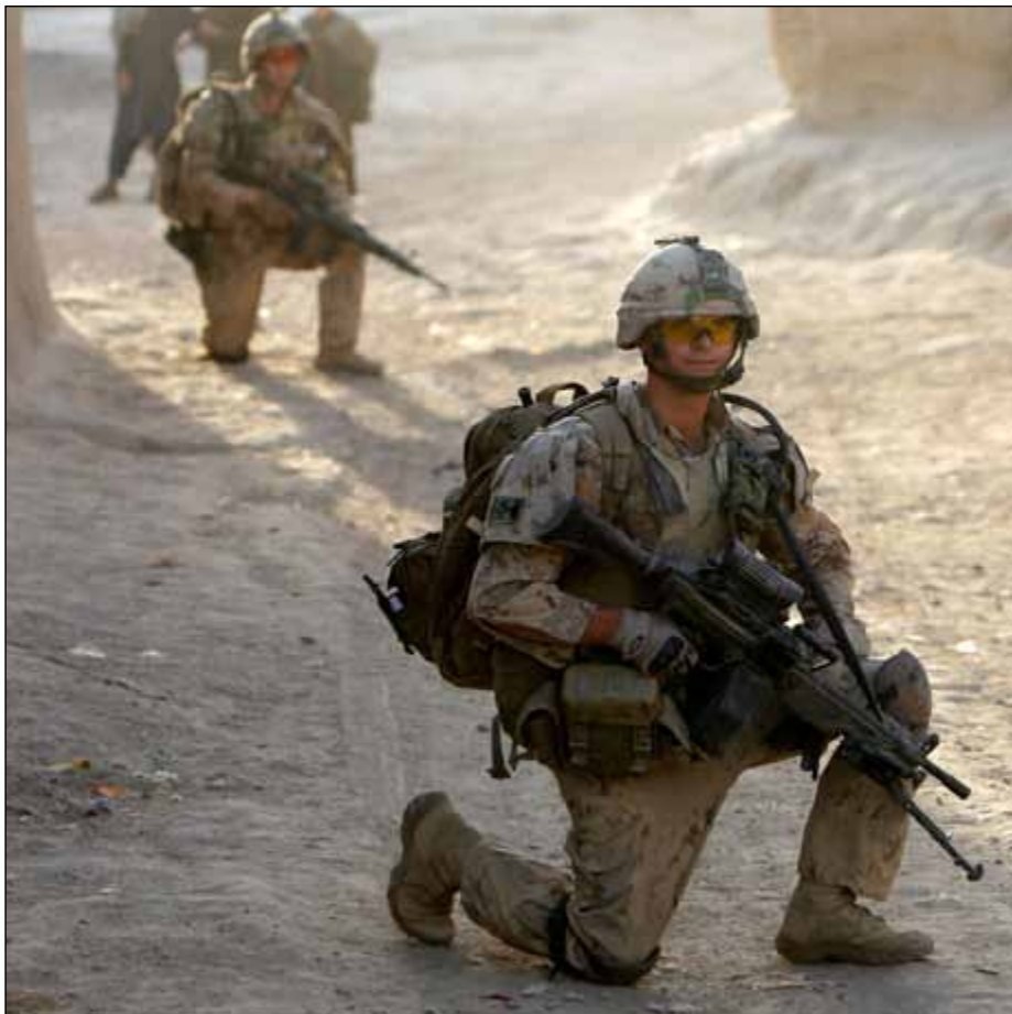
Soldiers with the Royal Canadian Regiment secure a street during a patrol in the village of Nakhonay in Panjwaii district, southern Afghanistan, June 10, 2010. Operation Enduring Freedom has been ongoing since October 2001.

The European Union (EU) is like a multiheaded beast with old forces of national self-interest and disorder lurking beneath the surface.