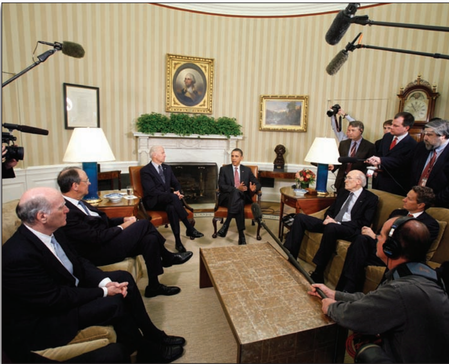
President Obama meets with the co-chairs of the fiscal commission to discuss reducing the rising U.S. deficit. The president's proposed 2012 budget nearly doubles the current debt position.

ous America's debt problems are. "It's much, much worse than I had expected," he stated.