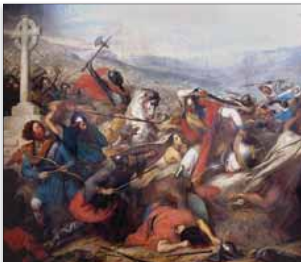
At the Battle of Tours, in October 732, soldiers under the command of the Frankish king Charles Martel stopped the Muslim advance into Western Europe.

Religious deception was the first and, in many ways, the most basic of problems