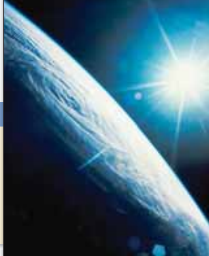
Will we see Bible prophecies fulfilled in our day? 4