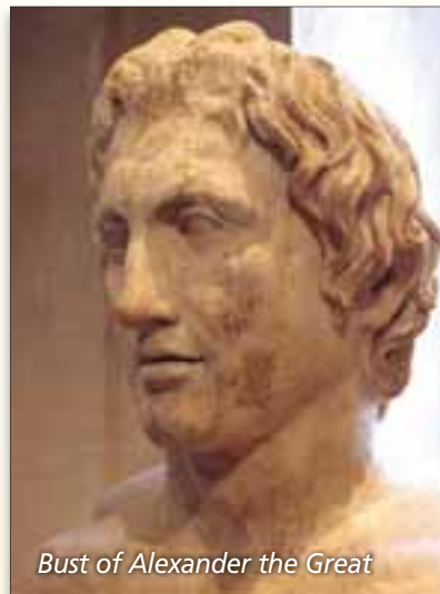
Bust of Alexander the Great