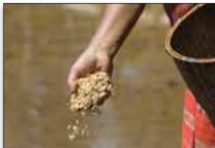
Are you fulfilling Christ's command to bear fruit? 26

Jesus Christ taught important spiritual lessons regarding the "fruit" we should bear in our lives. What are those lessons, and how well are we applying them? Our eternal life depends on this understanding! . . . . . 26