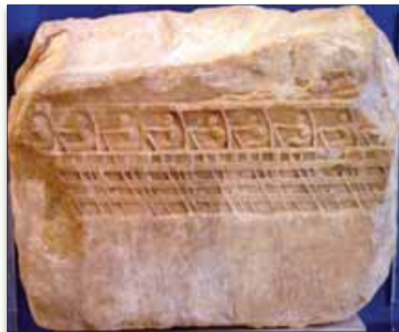
The Lenorman Relief, from the Acropolis in Athens, depicts the rowers of an Athenian trireme, the same kind of ship the Greeks used in their stunning victory over the Persians in the battle of Salamis.

After hearing the threats and orders to surrender from the Assyrian military commander, King Hezekiah went to God in earnest prayer. He was heard, and God answered him through the prophet Isaiah, who told