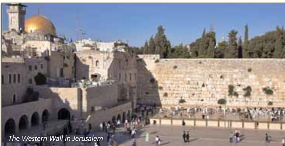
The Western Wall in Jerusalem

Jesus showed that Jerusalem would be the central focus of the political and military upheavals that would immediately precede His return. Anyone living a century ago would have found these words nearly impossible to comprehend.