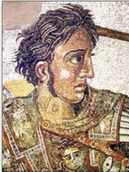
Alexander the Great, shown here in a mosaic from Pompeii, brought down the mighty Persian Empire before conquering the known world of his day—just as foretold in Bible prophecy.

He goes on to say: “It would be a world in which the values characteristic of the Greek city-states were lost in favor of a fusion of