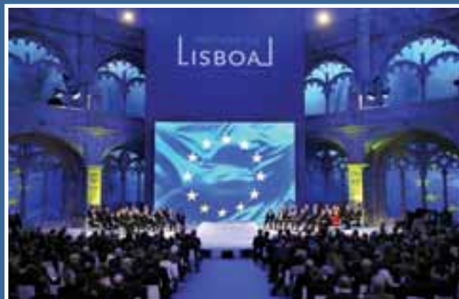
European leaders attend the signing ceremony for the Treaty of Lisbon on Dec. 13, 2007. Proponents essentially repackaged the rejected European constitution, relabeling it a "treaty" to bypass voters in the EU states.

The Economist also pointed out that this new EU treaty creates three competing positions for the so-called and mystical post of "Mr. Europe"; the newly proposed posts of EU president and EU foreign minister plus the president of the European Commission. This newsweekly speculated as to who "could become the figure regarded by the world as Mr Europe"—the most public face for this growing colossus.