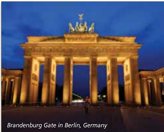
Brandenburg Gate in Berlin, Germany

Ephraim’s older brother Manasseh was also prophesied to become a great nation