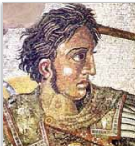
Has God guided world-transforming events? 10

Have key events in world history had a connection to Bible prophecy? A brief look at three events that shaped the world reveals God's guiding hand at work to bring to pass what He had foretold. . . . . 10