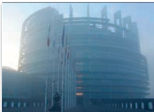
The European Parliament building in Strasbourg, France, emerges out of the morning mist.

The term of office and the powers of this new EU presidential office are definitely limited in scope