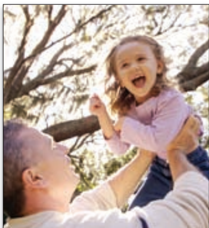
How can you teach your children right values? 9

Most parents recognize the need for their children to have right values. But how do you teach them? Where do you start? Here are 10 practical pointers parents can use to instill right standards, starting today! . . . . . 9