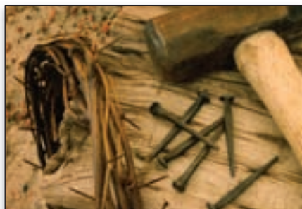
As the epitome of a servant, Jesus gave all 22

Europe continues its march toward its destiny, moving rapidly toward a time of transition that will surprise and shake the entire globe. How prepared are you for the changes that are coming to our world? . . . . . 25