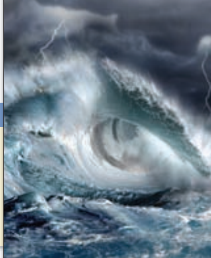
Redefining morality brings a wave of consequences 4