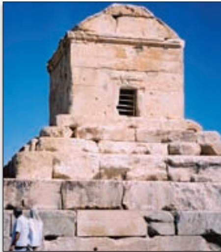
The tomb of Cyrus the Great, a prominent biblical figure, may soon be submerged, along with the remains of two major Persian cities, behind a dam in Iran.

In 539 B.C. Cyrus conquered Babylon. In doing so, he fulfilled Isaiah's prophecy that God would "open