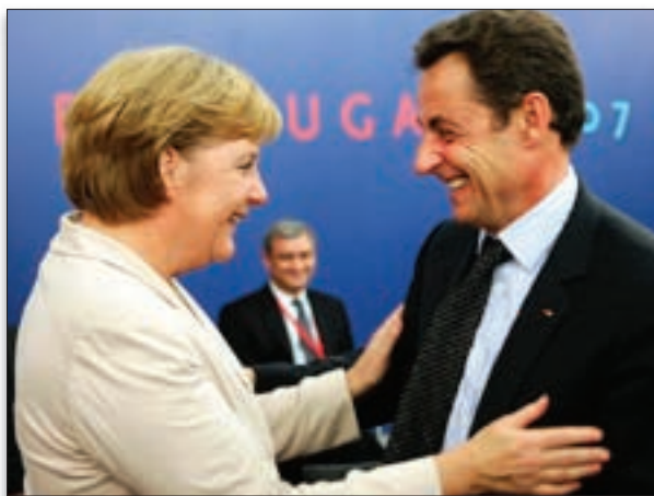
German Chancellor Angela Merkel and French President Nicolas Sarkozy greet each other warmly at a European Union summit in October 2007. The new European treaty signed in December will give their two countries even greater power in leading the EU.

The treaty establishes a new European Union in the form of a supranational federal