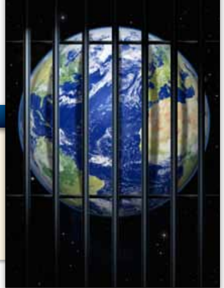
A world held in captivity by a cruel oppressor 4