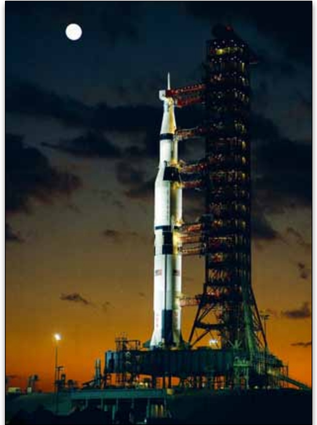
A giant Saturn V rocket stands ready to fly astronauts to the moon.

Victory by the Allied forces in World War II left the United States as the world’s undisputed supreme power. But within a few years, the Soviet Union also had atomic weapons. And in the next decade, these two powers would square off in another race for