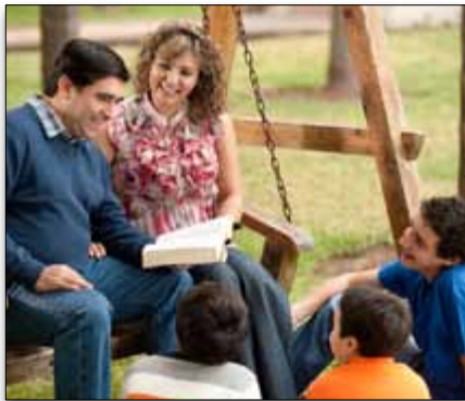
God's plan to transform the entire world 9

Much of Bible prophecy describes the Millennium—the first 1,000 years of Christ's reign on earth—showing it is important to God. And the more you understand it, the more important it will be to you! . . . . . 9