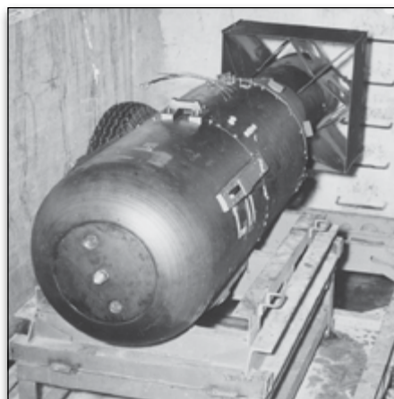
"Little Boy" was the world's first atomic bomb.