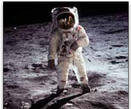
What's behind America's rise to superpower? 18

A little-noticed prophecy shows that Jesus Christ's return couldn't take place without a revolutionary change in global mass communications—a change that has taken place only in the last few years. . . . . 27