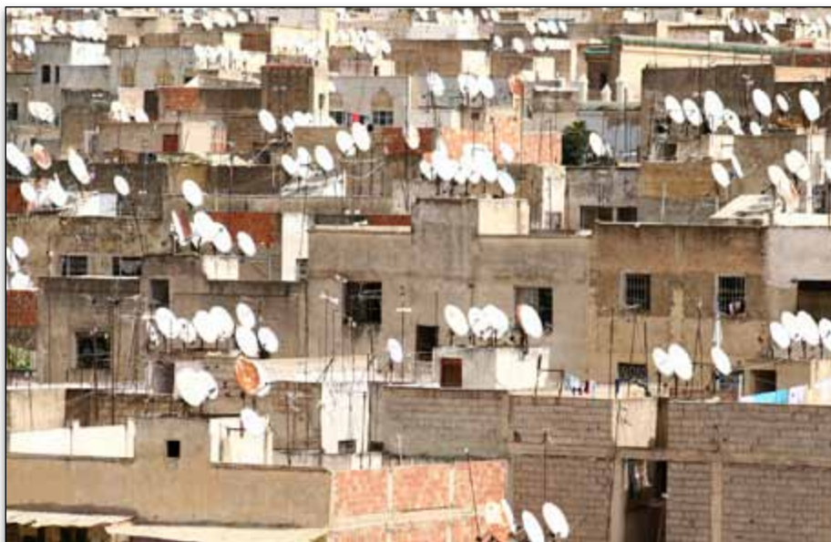
Instant communication to all corners of the world through the recent proliferation of global satellite television and Internet technology has now made it possible for an end-time prophecy to be fulfilled.

This passage reveals two important points if you want to know the answer to