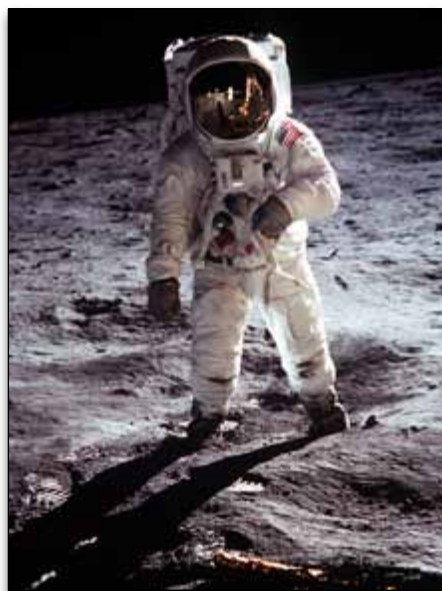
U.S. astronaut Buzz Aldrin walks on the moon.

The term rocket soon gave way to a new term: guided missile , a large rocket, directed in flight by a sophisticated guidance system,