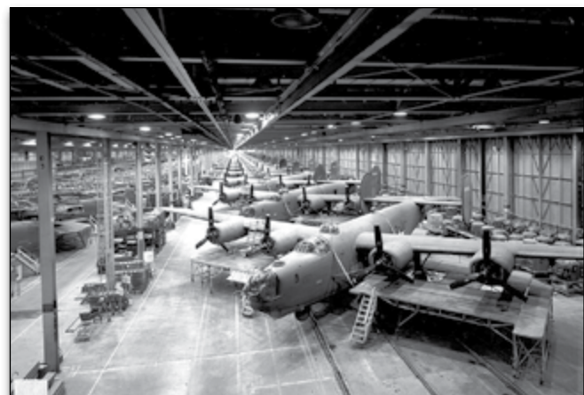
B-24 Liberator bombers are assembled in Willow Run, Michigan.

By the late 1930s, several of the world's leading physicists, such as Robert Oppenheimer, Enrico Fermi and Albert Einstein in the United States, and Otto Hahn,