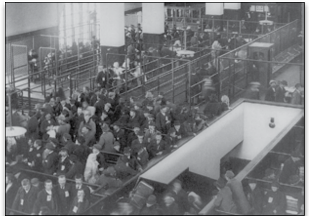
Immigrants arrive at New York's Ellis Island in 1904.

American industrial might blossomed. By the late 1920s, the United States had surpassed Great Britain and Germany as the world's leading coal, steel and iron