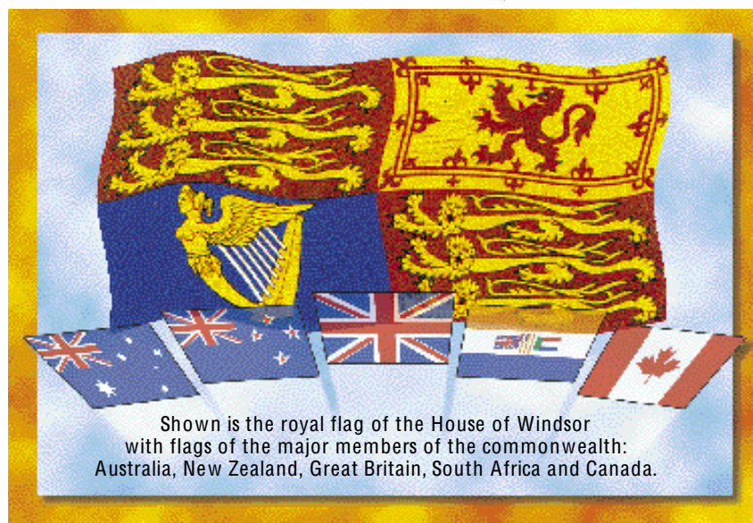
Shown is the royal flag of the House of Windsor with flags of the major members of the commonwealth: Australia, New Zealand, Great Britain, South Africa and Canada.

Later, totally independent nations were to embrace it voluntarily. In 1867, when Canada became an independent democratic country, it wanted to retain Britain's Queen Victoria as its own monarch. Taking inspiration from Psalm 72:8, the Canadians decided to