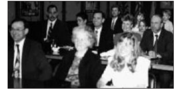
Members in Collinsville, Illinois, gather for a Family Christian Club meeting

various topics. It provides an opportunity for the entire congregation, young and old alike, to discuss and contribute to topics or themes of mutual interest. The Family Christian Club