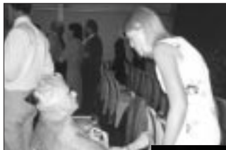
Women give, teach and serve in many ways today, preparing for greater roles in God's kingdom

The Scriptures are also clear that God grants both men and women His Holy Spirit with its accompanying wisdom. At the founding of the New Testament