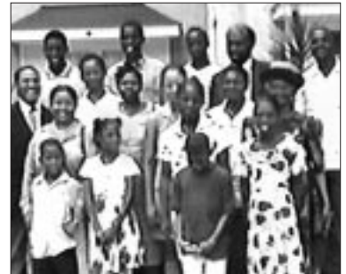
Group shot from the Feast in Jamaica 1999

"I do request that you send your literature, also audio and videocassettes, so I could