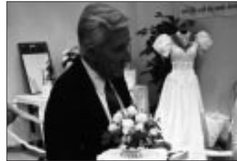
The San Antonio, Texas, congregation's 45th anniversary had the theme of the bride of Christ making herself ready

Sabbath, November 6, 1999, was the 45th anniversary of the San Antonio, Texas,