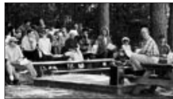
Bible study on the shores of Lake Livingston

Nearly 250 brethren gathered on the shores of beautiful Lake Livingston for the third annual regional family campout, hosted by the two Houston, Texas, congregations November 5 to 7. The weather was perfect, with highs in the 80s and lows in the 50s, no rain and clear blue skies. Campers arrived from as far away as Denver, Colorado!