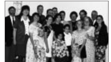
The Fresno, California, congregation held its inaugural service October 23