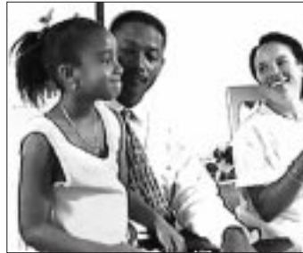
Family Club meeting in Freeport, Bahamas

Bahamas in 1997 and recently UCG Dominica completed its incorporation. There is a mini office in the Bahamas that oversees the Work in the region. God has led the Council and home office to provide a yearly subsidy so that members, associates and Good News subscribers can have better service in the area.