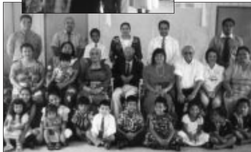
Children's choir and the whole group in Tonga

It was a n o t h e r happy and wonderful Feast for all who attended in