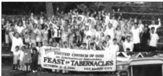
Baguio City, Philippines