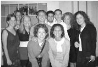
The Friday Night Live crew