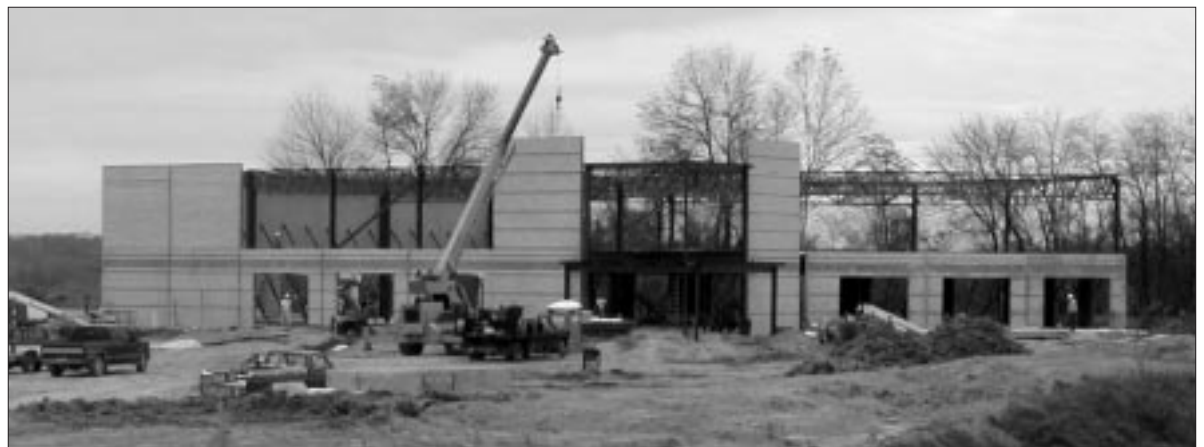
A view of the construction site for the new home office taken October 30. Updated photos posted at www.ucgcincinnati.org

that this new facility will be a blessing that will lead to considerable increases in operational efficiencies in this part of the work of the Church." UN