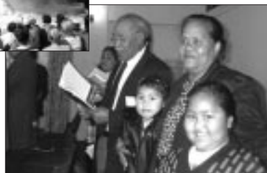
Scenes from the Feast in New Zealand

attended our annual Feast dinner. Feast messages focused on our incredible millennial future and our spiritual grounding in God's Holy Day plan during these turbulent times.