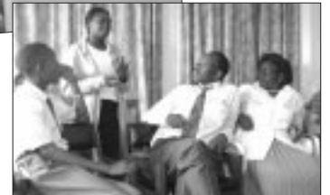
Malakia clinic in Malawi; brethren in Zimbabwe

from Zimbabwe, Zambia, Malawi, South Africa and the United States attended the Feast in Zimbabwe's capital city of Harare. Although there is still political uncertainty and hyperinflation with prices of basic commodities rising every day, we were able to keep the Feast in a most uplifting united and warm family atmosphere.