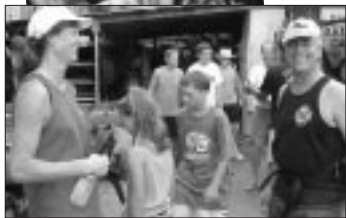
Lihue

ed family from Canada was somewhere around 14. There were several groups from congregations who traveled together to keep the Feast in Hawaii. All these groups and families added a very special spirit to our Feast.