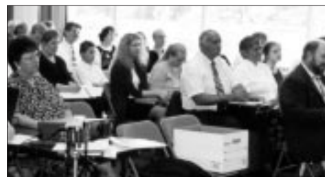
ABC mini-sampler in St. Paul, Minnesota

The applications to ABC for 2002 continue to arrive at the home office. At press time, 52 had been accepted, with several