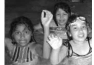
El Salvador