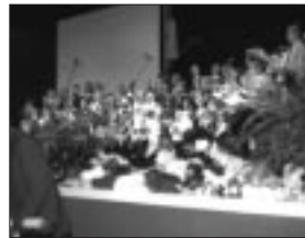
Wisconsin Dells