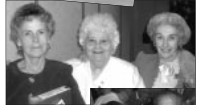
Gettysburg

the air was a little nippy for the Last Great Day luncheon, many of the brethren