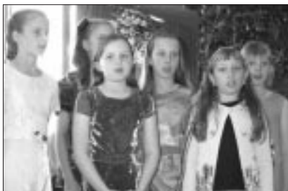
Merimbula children's choir

The very best of this wonderful Feast was spiritual—the speaking, music and singing. Sermons and sermonettes were varied and strong, reflecting the urgency