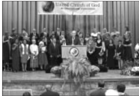
Gatlinburg Feast choir

The many activities also proved successful with three in particular drawing strong numbers: a night at the Dixie Stampede (a dinner theater), family day at Dollywood and a family dance on Saturday night. Other activities involving many folks of different ages included "sleep with the sharks" (a night spent in the aquarium for our elementary-age children), a night of pickin' and grinin' to show off some of the Church's musical talent, a seniors' lunch with games and