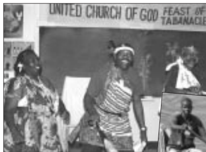
Members performing a Kikuyu dance in Kenya; Kenyan and Tanzanian brethren on Lake Victoria during the Feast

The brethren enjoyed positive fellowship, an afternoon of games, a talent show featuring various cultural dances, a trip to Homa Bay on Lake Victoria and a goat roast on the afternoon before the Last Great Day. One of the highlights of the Feast was a trip to Ruma National Park,