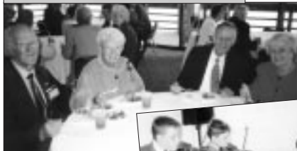
Teen pool/beach party; teens provide music for the seniors' luncheon