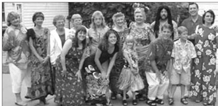
Milwaukee brethren go Jamaican September 9

The Akron crew is currently responsible for reading the Good News magazine, Bible