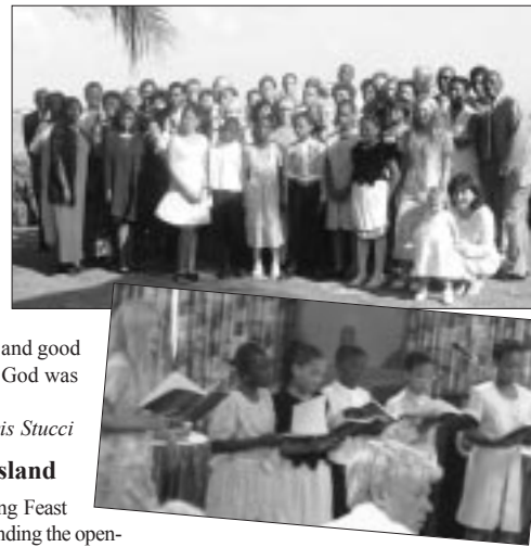
The group in Barbados and children's choir

We changed venues for the Feast this year in Barbados. We met at the Sand Acres/Bougainvillea Beach Resort on the south coast of the island. The facility is