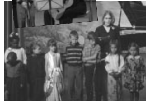
The talent show in Germany