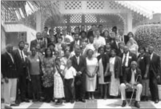
The Feast group in St. Lucia

We met at the Bay Gardens Hotel which is situated in the tourist resort location of Rodney Bay. As the name implies, Bay Gardens is structured with ornamental plants and flowers on its