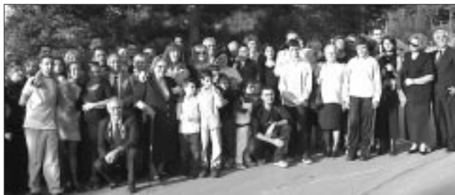
The Italian brethren

Not only were the sermons strong and unifying, but also the activities drew everyone together. A ladies' breakfast, a seniors' breakfast, a young peoples' dance, a Spokesman's Club and Ladies' Night and a children's party were all enthusiastically attended. A special trip to Lake Atitlan was arranged for the foreigners. They were able to see one of the largest lakes in Guatemala and the beautiful countryside. This