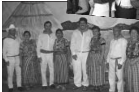
Guatemalan dancers and friends

hungry for more. We were encouraged to prepare our families and ourselves for the difficult times ahead by developing strong, righteous character.