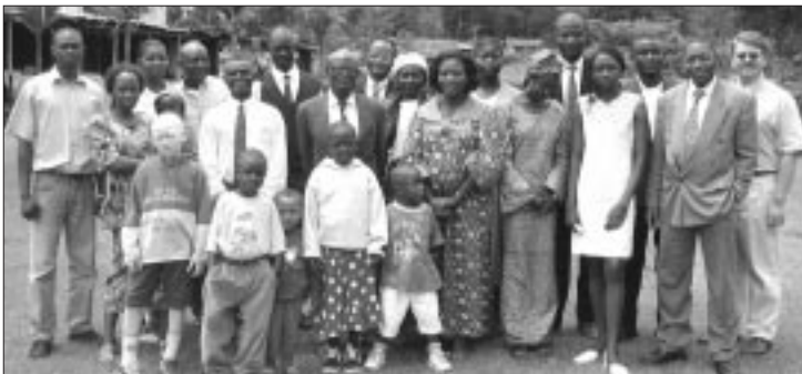
The group on the first day in Cameroon

This year the brethren from all over Cameroon assembled to celebrate the