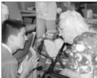
Campers in Australia prepare for and then visit elderly people in a nursing home