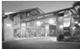
Inn of the Hills Conference Resort, Kerrville, Texas

Kerrville is only one hour from beautiful San Antonio on one of the state's most scenic drives. It is only 1 1/2 hours from Austin and 4 hours from the Dallas/Ft. Worth area. The elevation is 1,645 feet with mild climate and weather averaging a high of 80 and a low of 52.