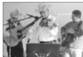
Austin Music Fest—see article, page 14, February UN