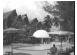
Feast hotel for internationals near Mombasa, Kenya

We also toured a resort that became my top choice for the Feast of Tabernacles this year. The accommodations and seaside location will afford a millennial-type environment for the Feast. The cost is similar to other resorts, but it offers much more for our brethren. Transportation for the membership is not that much more expensive than other locations would be, either. Each local member can travel to the Feast, have nice