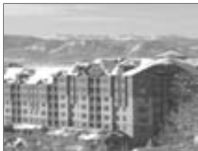
Steamboat Grand Resort Hotel

In north-central Colorado at the head of the Yampa River Valley, and at an elevation of only 6,710 feet, lies the major destination ski resort of Steam-