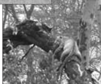
A curious waterbuck and a leopard sleeping in a tree with its kill in the Nakuru State Park