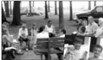
Classes and dressing up for a play about biblical characters at the Lewistown Youth Camp

This year's theme focused on Ruth and Naomi. The youth learned the importance of faithfulness, loyalty, courage and character—all traits exhibited by Ruth, great-grandmother of King