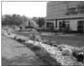
Dry creek bed behind the home office building

Since the staff moved into the home office building in April 2002, the sur-