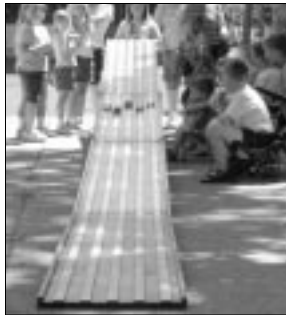
Spectators watch the Columbus Pine Car Derby

After the traditional cookout/potluck meal (and an incredible array of desserts), Columbus held its second annual Pine Car Derby. The theme was