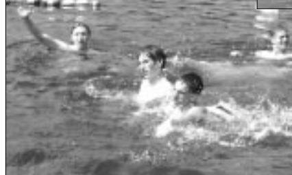
Camp Heritage activities included speedway, basketball and water polo

charge and protecting us from the elements and the "prince of the power of the air." All the campers were safe and