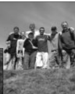
Activities at the seventh UCG—British Isles' Summer Camp include an underground boat trip, archery and an all-day hike

The traditional skits were performed after a barbecue at the end of the Sabbath. Skits included a review of camp using some of the tunes from Phantom