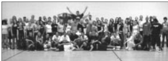
Teens and young adults gather in Garden Grove

Saturday's events began around 9:30 a.m. with a pancake brunch at the home