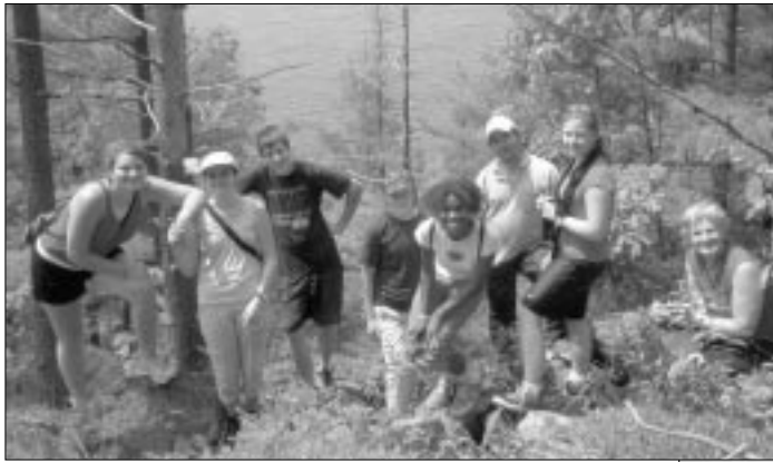
Campers hike to scenic lookout after canoeing across Charleston Lake; horse riding lessons

After a hearty breakfast Sabbath morning, a Christian Living Bible