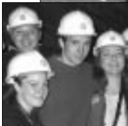
captained the victorious football team.

Campers found it interesting to have various nationalities present at camp. "We are so similar despite obvious [language] differences. As humans we all have the same desires and needs—and we all love to laugh!" said one young adult.