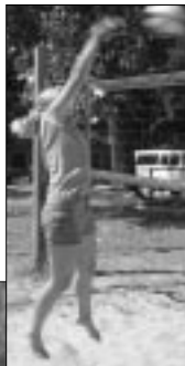
complete revision of the schedule.

the temperature about 20 degrees. It was a welcome relief from the heat—even though the rain Wednesday morning, forced a