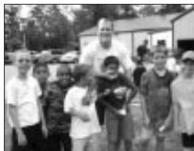
Scene from the Texas Preteen Camp

A record 51 campers attended the Texas Preteen Camp in the Houston, Texas, area June 5 to 8, but the horseflies