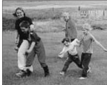
Three-legged race at Calgary Junior Kids Camp