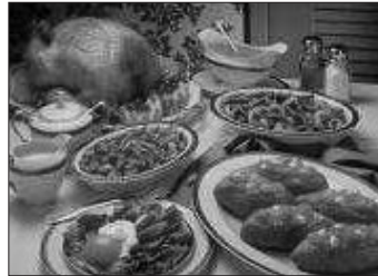
A Thanksgiving meal represents a never-in-a-lifetime experience to much of the world

My children receive free public education. While our public education system has its problems, even with its flaws we can be