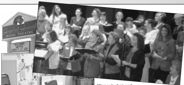
Women's choir and Festival Youth Instruction at Wisconsin Dells

truths as found in the annual Holy Days and for inviting us to observe them each year.