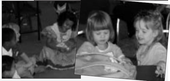
Kindergarteners in Branson learn how the nature of wild animals will change in the world tomorrow. Left, second and third graders in Branson play a game to help learn about God's kingdom