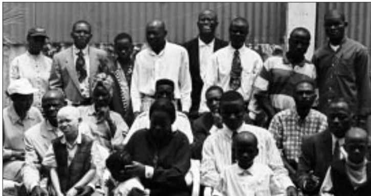
Some of the Feastgoers at Douala, Cameroon