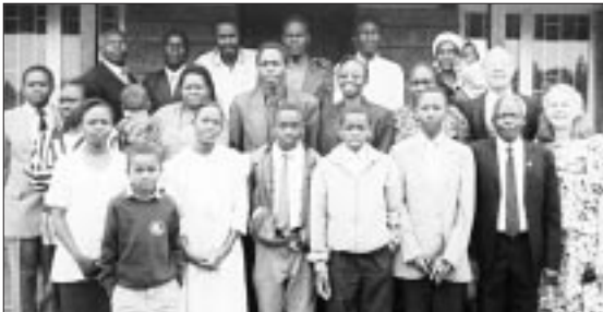
Group photo of the Feastgoers in Nairobi, Kenya

Members took an outing to a national park in the Great Rift Valley where they enjoyed the beauty of the wild game of Africa and the smoldering steam from a dormant