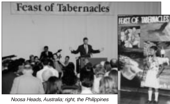
Noosa Heads, Australia; right, the Philippines