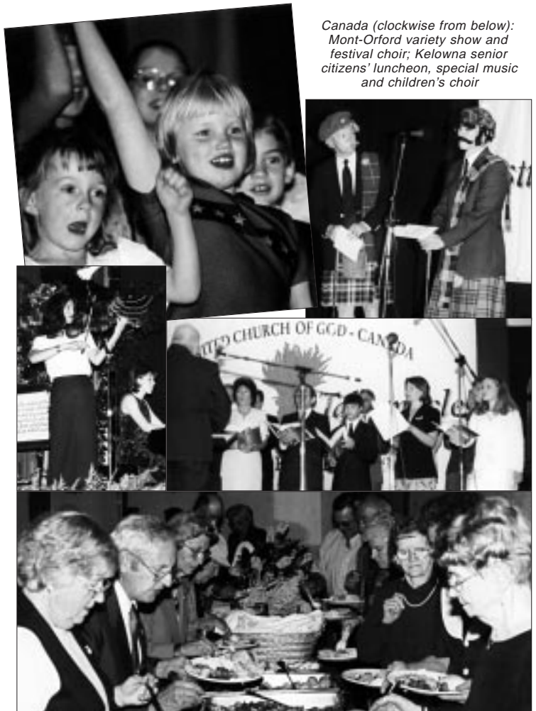
Canada (clockwise from below): Mont-Orford variety show and festival choir; Kelowna senior citizens' luncheon, special music and children's choir

Festival activities included a seniors' luncheon, a boat cruise, a wine train excursion, a family dance, a family day activity, a staff reception, laser bowling for the teens, a singles' hike, festival youth lessons, an interactive teen study, a ministerial dinner and a young adults' presentation. Also, there was a special youth day when the young people