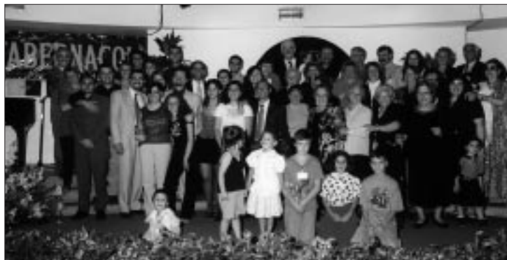
At the Feast in Sabaudia (Latina), Italy

A power outage in the entire city might have put a stop to the Ladies' Breakfast on Monday morning, but plans for the breakfast went on as scheduled and the power returned just as the breakfast was scheduled to start. Everyone attending was able to take home