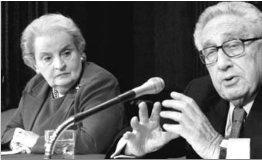
Former Secretaries of State Madeleine Albright and Henry Kissinger shown here before Senate Foreign Relations Committee Sept. 26, 2002

holds the roadmap to peace, and real peace among people can come only through us first making peace with Him.