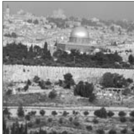
Christ wept over Jerusalem and the coming tragedy that would befall the city.

Let me try to answer that question by taking the oft-repeated question, “What would Jesus do?” Let’s take the phrase off the bracelets and look into Scripture for an answer.