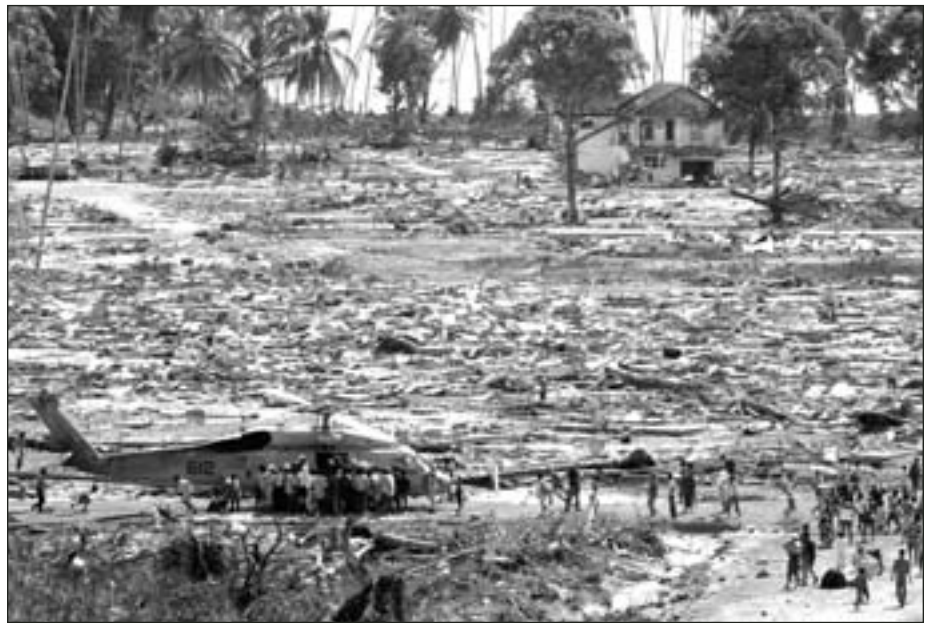
Indonesian tsunami survivors receive food and water from a U.S. helicopter in Aceh Jaya district Jan. 5.

It’s a quandary of human nature why at times it is easier to reach out to people we don’t know or will never meet than to be emotionally available to the people right around the corner. Yes, the nameless thousands need our help and still do. But those we do know, who share our homes, live in our neighborhoods, sit across the