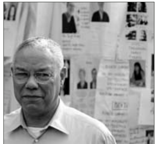
Former U.S. Secretary of State Colin Powell stands near photos of missing people at a tsunami relief center in Thailand Jan. 4

The writer, like everyone, was grappling with the reality of the attack and was saying to God, "If you could not have stopped the terrorists, why can't you at least stop the rain?" He looked to the