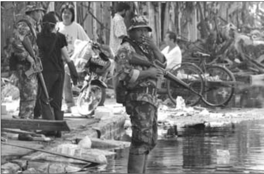
Indonesian soldiers patrol an empty shopping street devastated by the tsunami in Banda Aceh, Indonesia, Jan. 22. Nearly a month after the tsunami, aid workers continue to pull out hundreds of bodies every day from the rubble.

scoffers will come, scoffing and following their own evil desires. They will say, ‘Where is this “coming” [of Christ] he promised? Ever since our fathers died, everything goes on as it has since the beginning of creation’” (2 Peter 3:3-4, NIV).