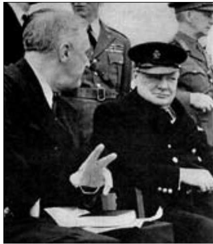
Franklin D. Roosevelt and Winston Churchill worked together to fight Hitler.

But the third assault rose from the ashes in the form of Soviet Communism. Russian forces did not retreat from