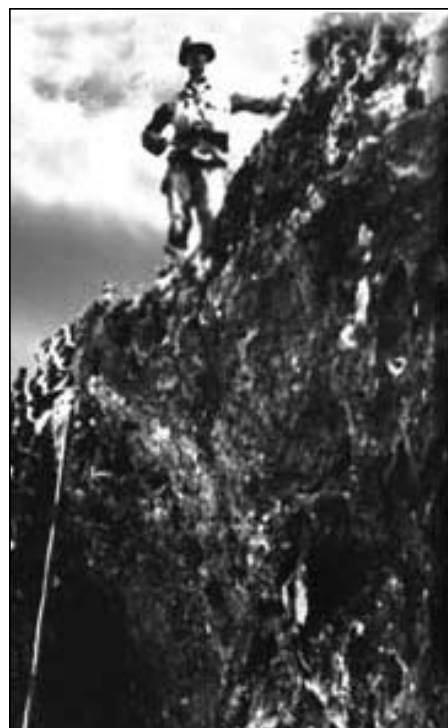
United States Army

Over the next 12 hours, he would drag the wounded one by one, sometimes two by two draped under his arms, a distance of 400 feet to the cliff’s edge. He would then lower them one by one, 75 in all, down the 70-foot cliff by rope.