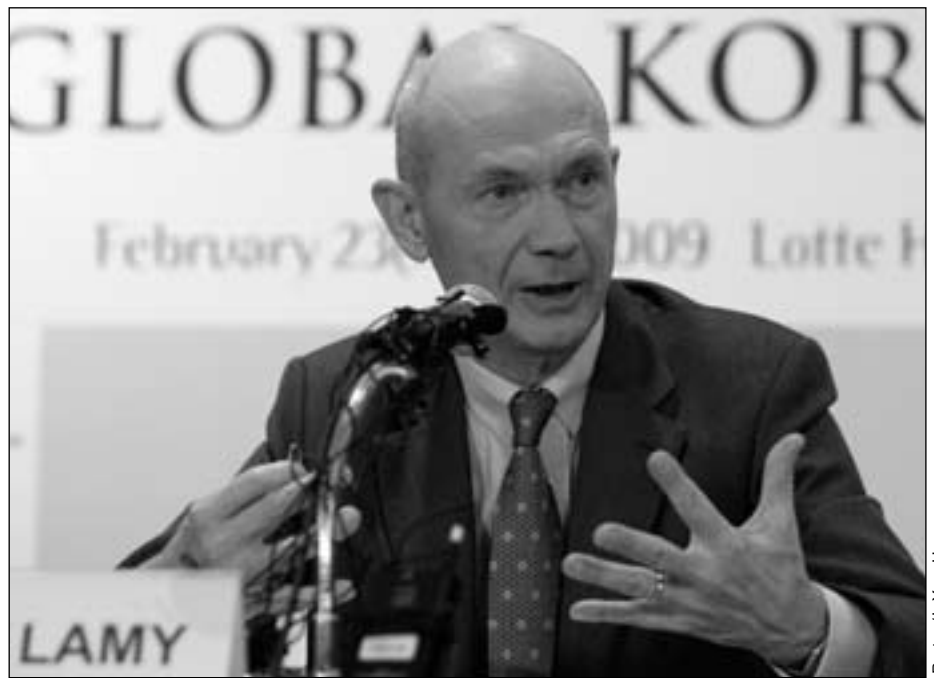
World Trade Organization Director-General Pascal Lamy speaks at a news conference at “Global Korea 2009: Korea in a Reshaping World” in Seoul Feb. 23, 2009. Lamy referred to the “Buy American” act of the U.S. stimulus bill as “a mixed bag” that raises protectionist pressure but has been implemented in a way that meets global trade rules.

The term “trade war” strikes a nerve in me. Over 30 years ago, I remember taking an economics class at college where the professor, an avid Bible prophecy reader, mentioned that the most feasible end-time scenario would be one where an international trade war begins the process.