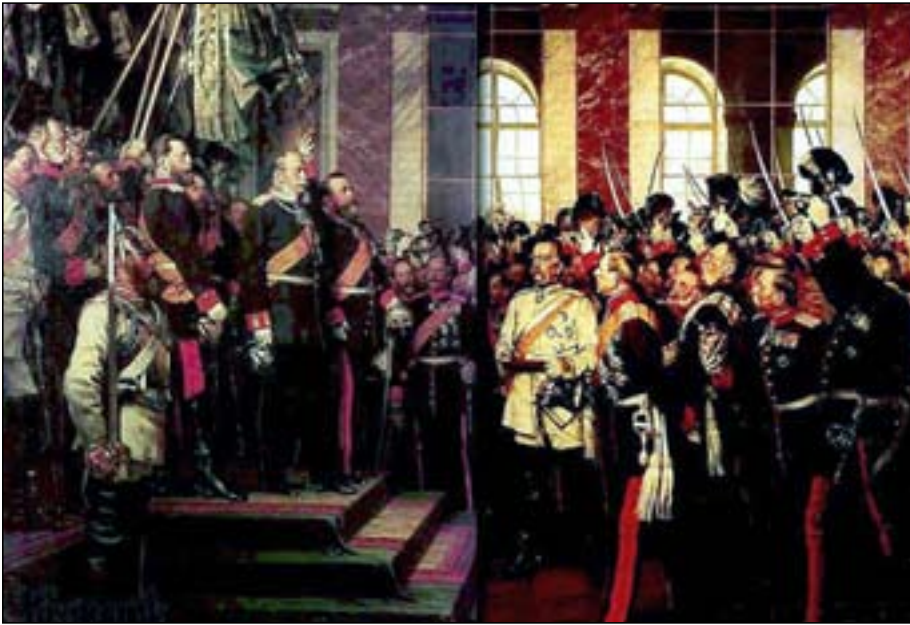
This painting by artist Anton von Werner depicts the crowning of Kaiser Wilhelm I in the Hall of Mirrors at the French palace in Versailles on Jan. 18, 1871. Otto von Bismarck can be seen in the white uniform in the center of the painting.

and the Germans in one kingdom, the second revival of the Roman Empire. After Charlemagne, France and Germany gradually developed their own separate identities, but, as neighbors, their destinies were set to be entwined.