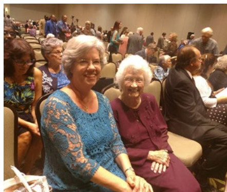
Jekyll Island, Georgia

Major airports for arrival and departure are Jacksonville, Florida, and Savannah, Georgia, which are both approximately an hour away, and Brunswick, Georgia, which is within 20 miles of the site. A rental car is advised. There is a small toll per vehicle each day one enters the island. Weekly vehicle passes are also available.