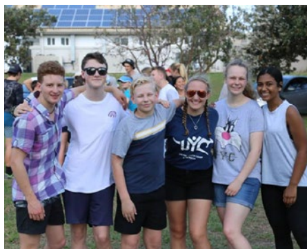
Sunshine Coast, Australia

The Feast sites are listed in alphabetical order by country. More sites may be added online at www.ucg.org/members/feast . The + sign at the beginning of international phone numbers signifies the country code. Canadian sites list prices in Canadian dollars. Dollar amounts for all other sites are in U.S. currency unless noted otherwise. The website www.xe.com , among others, provides up-to-date currency conversion information.