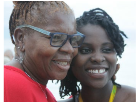
Montego Bay, Jamaica

Blantyre has pleasant climate set in a range of hills at the altitude of about 1,000 meters, and it has a rather pleasant climate most of