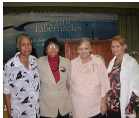
Margate, South Africa

The beautiful beach resort is nestled on a vast expanse of golden sandy shore with an unspoiled beach and palm trees on the beautiful Passikudah Bay along a stretch of coastline renowned for its calm and shallow waters ideal for swimming and water sports. It is situated 325 kilometers from Colombo on the eastern coastline on the Indian Ocean. The drive will be approximately five to six hours from Colombo. Local brethren will assist to coordinate transportation options from the airport or from the city of Colombo to the Feast site