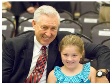
Panama City Beach, Florida