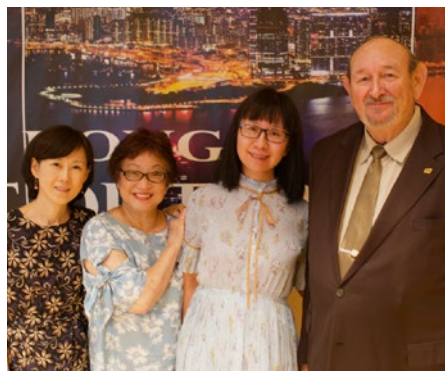
Hong Kong, China

of the Feast site. Named a UNESCO World Biosphere Reserve in 1984, La Campana contains one of the last remaining Chilean palm tree forests and boasts a summit view of both the Andes mountain range and the Pacific Ocean all at once.