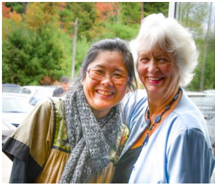
Wisconsin Dells, Wisconsin