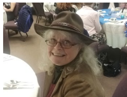
Glacier Country, Montana

Again the beautiful and majestic area of Northwest Montana known as Glacier Country will host the Feast of Tabernacles. This region of Montana is world renowned for its mountains, rivers and wilderness areas—especially Glacier National Park, the Bob Marshall Wilderness and Flathead Lake. In addition to the grand landscapes, the small towns abound with great restaurants and shopping opportunities.