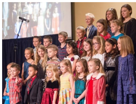
Steamboat Springs, Colorado

There are many things to see and do at the resort, including a lake with canoes and paddle boats, ski lift rides, mountain biking, golfing, an indoor/outdoor heated pool, hiking and more. Nearby is the National Radio Astronomy Observatory, Green Bank Science Center, Greenbrier River Trail and the Cass Scenic Railroad. About 90 minutes away is the Greenbrier—an iconic luxury resort built in 1778 and famous for housing the once-secret U.S. Government emergency bunker.