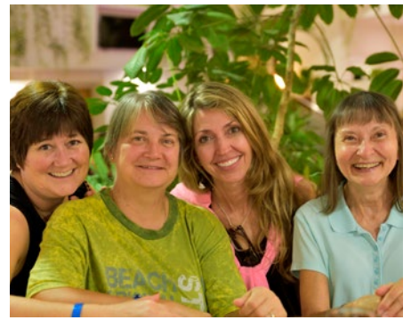
Puerto Vallarta, Mexico

Reservations and Information: Please visit www.regpacks.com/vallartafot . You need to create an account and fill out the initial application. Once accepted, you will be able to make your housing arrangements through the same website, as well as pay for your housing, choose your activities and sign up for volunteer opportunities. Registration opens on April 1, and there will be a $300 deposit per room due June 1. We expect the site to fill completely so sign up as soon as possible. Final payment is due Aug. 15 and