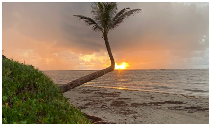
Left: Adult choir in Branson, Missouri. Right: Sunrise in St. Lucia.