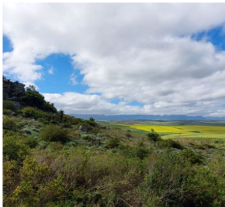
Mossel Bay, South Africa

The hotel also has two fantastic restaurants. For self-catering rates you’ll