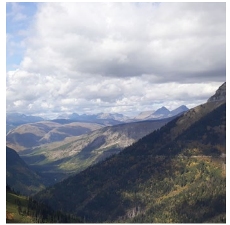
Glacier Country, Montana

The Glacier Bible Camp offers a wide range of onsite accommodations. These accommodations make it possible to attend the Feast in Montana very reasonably. Some find the camping and dorm options reminiscent of early Feasts held in Big Sandy, Texas, in the Piney woods or Booth