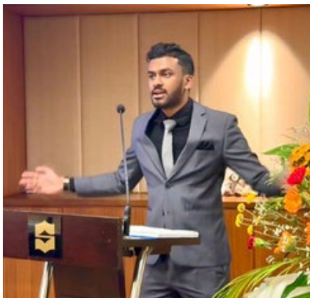
Leading songs in Malaysia