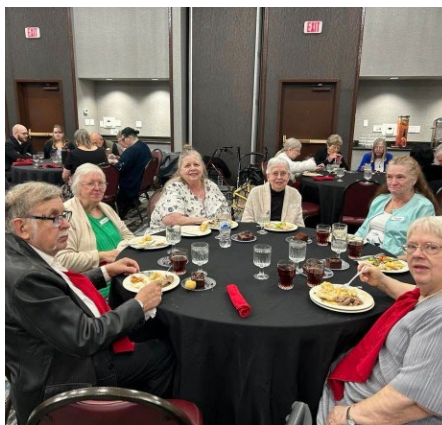
Seniors' luncheon in Cincinnati, Ohio

$269 1-bedroom, oceanfront king suite with kitchenette