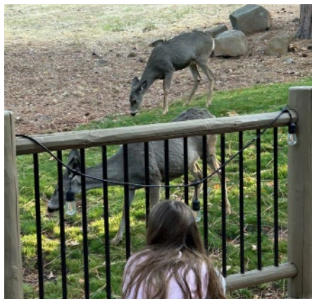
Enjoying nature in Klamath Falls, Oregon

tional Park (see glacierbiblecamp.org for more information). Glacier Bible Camp calls their largest meeting building the "Tabernacle," and this is where daily services are held. It is designed to accommodate 1,000 people with comfortable cushioned chairs. Although we are not expecting 1,000 brethren to attend, it does mean we should be able to accommodate all who desire to come to Montana to celebrate the Feast.