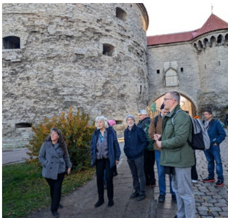
Brethren on a tour in Estonia