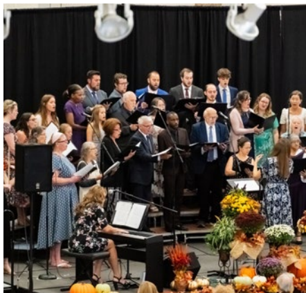
A choir in Morehead City, North Carolina

Features: ac, e, fw, hr, k, kq, l, op, or, s, sf, wf, 10 units available. Microwave, refrigerator, sink (no stove top), back-side looks out to Bogue Sound, 3.5 miles from site. To book online, click "Book Now," then "Do you have a group code?" Enter the code UCOG100625 and click "Search Availability." (Note that check-in date must be Oct. 6 to book with these rates.) Rates available two days before and after the festival term. Taxes: 12.75 percent.