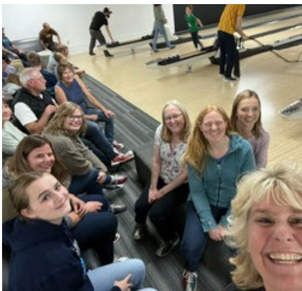
Brethren bowling in Kelowna, British Columbia

St. John's is a beautiful area located on the eastern tip of the Avalon Peninsula on the lovely island of Newfoundland. It is the most easterly city in all of North America. The capital and largest city of the Canadian province of Newfoundland and Labrador, this city traces its history back to 1497, when Italian explorer John Cabot first landed on the shores of what is now Newfoundland and Labrador. Thus, St. John's is the oldest European settlement in Canada and one of the oldest in North America.