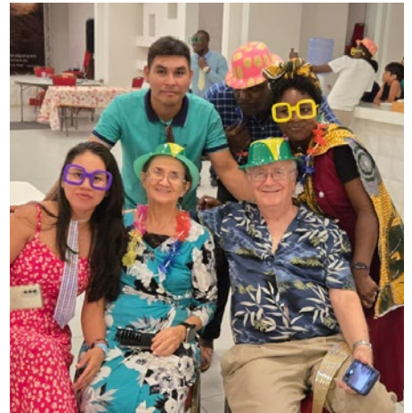
Porto Seguro, Brazil