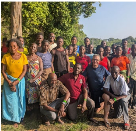
Brethren outdoors in Zambia