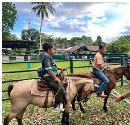
Riding horses in Visayas, Philippines

Don't forget to check feast.ucg.org for updates.