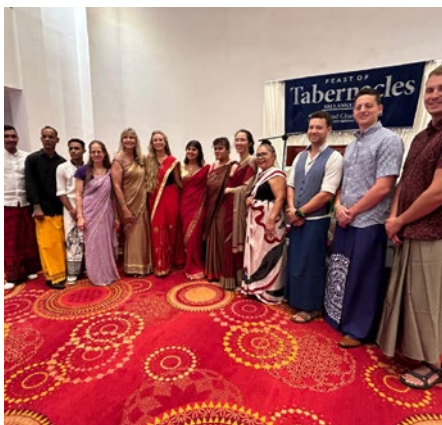
Traditional garments in Sri Lanka

No charge for children ages 2-6—limited to two children per room when sharing bed with parent(s). Children ages 7-11 cost 50 percent of adult meal rates up to a maximum of two children per room (extra bed charges are applicable). If you choose to make your own reservations, you will pay the higher standard hotel rates.