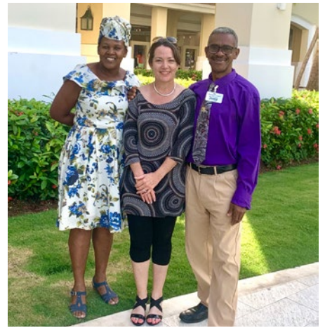
Montego Bay, Jamaica