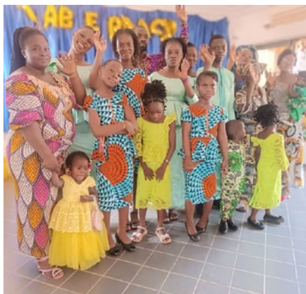
Women and children in Benin

a Apartment/condominium ac Air conditioning bb Bed-and-breakfast c Campground cb Continental breakfast included d Dump station e Elevator ec Electric fw Free wireless h Hotel/motel