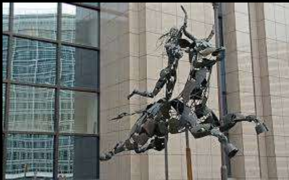
A statue of Europa riding the bull right next to the Europa building

The new European Council headquarters in Brussels, Belgium, called the Europa building, with a vainglorious “space egg” or “ovum” meeting room. As we saw in The Economist drawing, each European head of state is now depicted, because of their power, as a king .