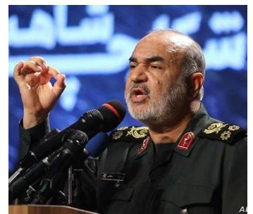
Hossein Salami IRGC Commander

‘Don’t count on THAAD. Every time you fire a projectile, we will fire more than you,’ Salami threatened...”