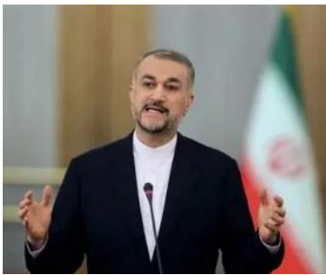
Iran Foreign Minister

July 29, 2025 spacewar.com reported: “Iran’s foreign minister warned on Monday that it would respond to the United States and Israel in a ‘more decisive manner’ should they attack Iran again.