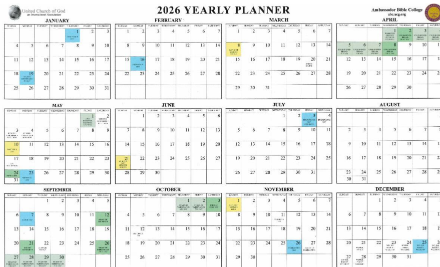
2026 magnetic, dry-erase ABC calendar.

The calendar is an 11" by 8.5" glossy full-year calendar printed on a dry-erase surface. It has the Holy Days and U.S. federal holidays marked.