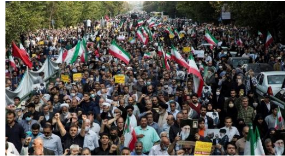
Iranians protest against Ayatollah Khamenei

Other footage posted to social media showed protesters destroying and toppling a statue of Qassem Soleimani, former head of the Quds Force of the Iranian Revolutionary Guards Corps (IRGC), in Fars Province.