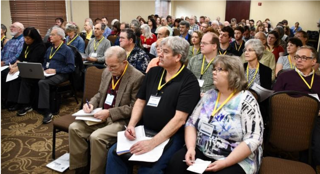
The audience for the Leadership Workshop in Portland.

Preceding the ministerial regional conference, we held a one-day regional leadership workshop. About 100 were in attendance for quite a lively day of meetings and discussion! It is encouraging to see so many members who have the interest and desire to do more in serving the Church.