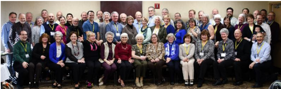
Participants at the Northwest Region Ministerial Conference.

This past week we held three days of Leadership and Ministerial conferences in Portland, Oregon.