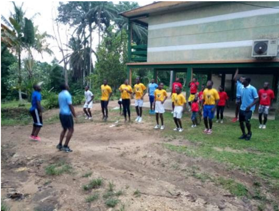
Cote d'Ivoire Youth Camp - March 21, 2018

During this trip, we also began construction to enlarge and add plumbing and electricity to our church building in La Mé (about one hour north of Abidjan).