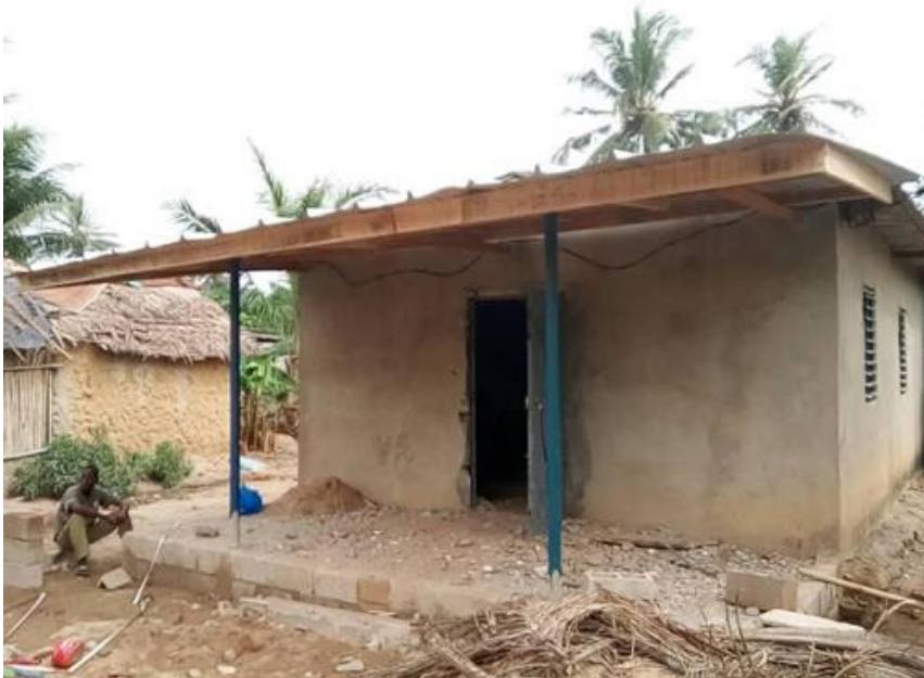
Church Hall in La Mé, Cote d'Ivoire - repairs in progress

During this trip, we also began construction to enlarge and add plumbing and electricity to our church building in La Mé (about one hour north of Abidjan).