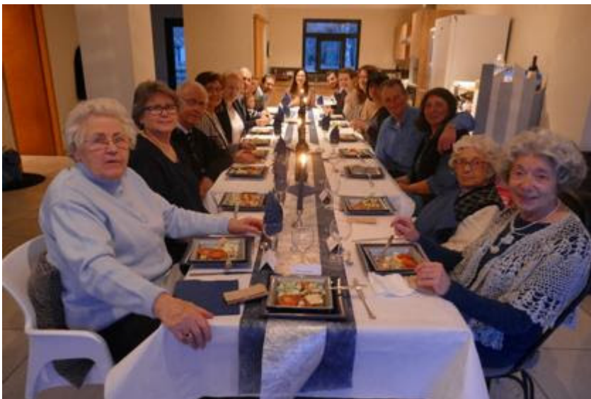
Night to Be Much Observed 2018 - Sainte Hélène, France

For the Passover, Night to Be Much Observed, and the First Day of Unleavened Bread, we rented a five-bedroom house outside of Bordeaux and French brethren drove in from around the country to spend the days together. We had 19 people for Passover. It was a very special weekend celebrating God's Holy Days together. We also took advantage of the Sunday after the First Day of Unleavened Bread for interactive discussions of core Biblical prophetic teachings where I presented three two-hour interactive seminars.