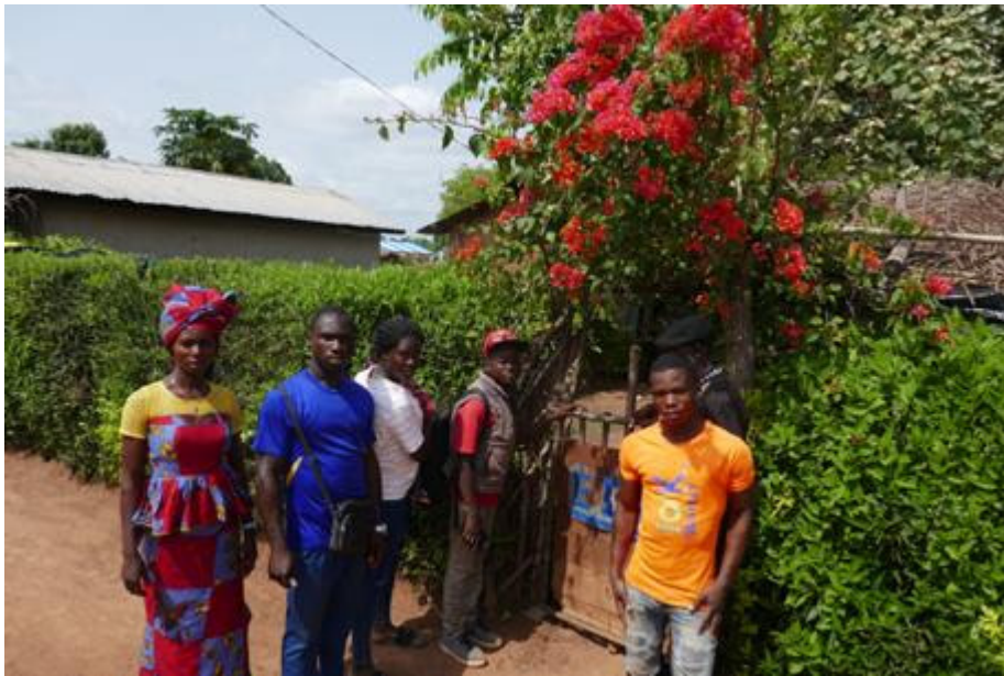
Blolé, Cote d'Ivoire, brethren in front of entrance gate to church.