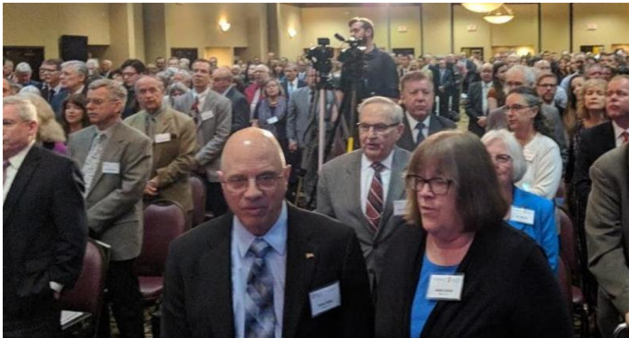
Sabbath Services at the Annual Meeting of the GCE

288 elders and wives met for the annual meeting of the General Conference of Elders in Cincinnati, Ohio, from May 4-7. Many acclaimed it to have been one of the best conferences that they had attended in terms of positive energy, unity, relevance and encouragement.