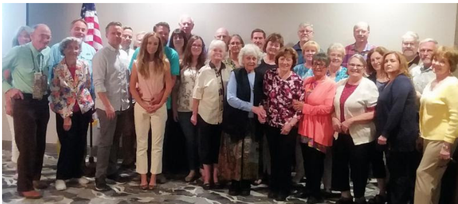
Attendees at the ABC Sampler in Boise, Idaho.