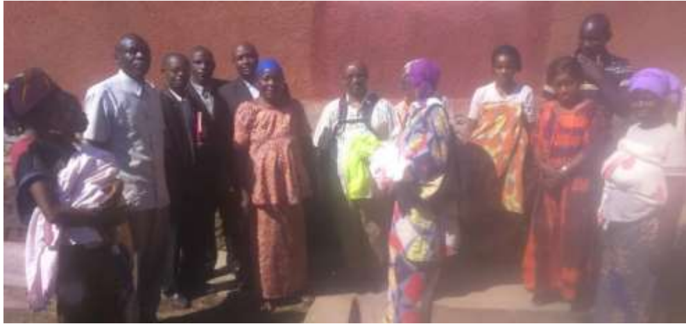
Visiting the Bible study group in Rubavu.

On June 12, we visited the Bible study group in Rubavu. The next day, we visited the group in Mukamira. Not many were in attendance because there were three burial ceremonies in the area which most of the people of this group were attending. On June 14, we visited another group in Kabatwa. On the Sabbath of June 16, we met with the Musanze congregation. The congregation is dynamic and comprised of 5 committed families. Weekly Sabbath attendance is between 23 to 30 people. The Sabbath services are like those held at any other UCG congregations around the world. Services were conducted in English with translation into the Rwandese language.