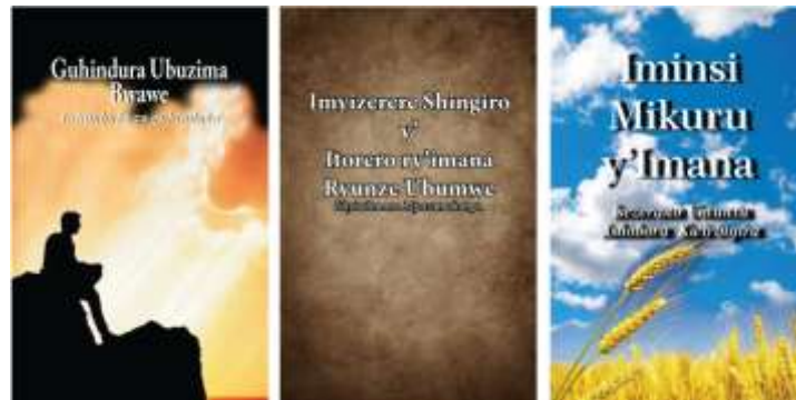
Booklets in the Rwandese language.

On June 12, we visited the Bible study group in Rubavu. The next day, we visited the group in Mukamira. Not many were in attendance because there were three burial ceremonies in the area which most of the people of this group were attending. On June 14, we visited another group in Kabatwa. On the Sabbath of June 16, we met with the Musanze congregation. The congregation is dynamic and comprised of 5 committed families. Weekly Sabbath attendance is between 23 to 30 people. The Sabbath services are like those held at any other UCG congregations around the world. Services were conducted in English with translation into the Rwandese language.