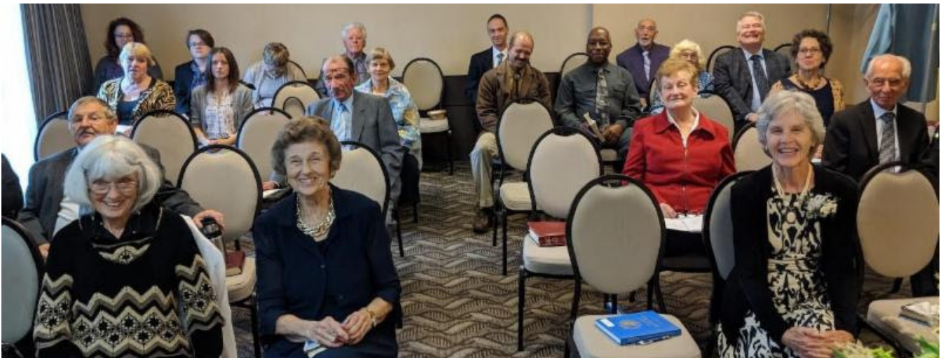
Feast of Trumpets in Windsor, Ontario