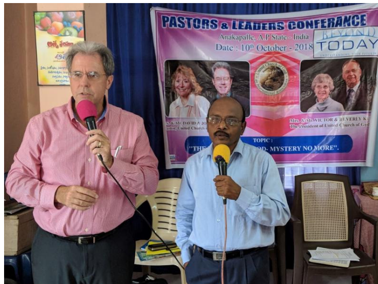
Question and answer session in Anakapalle, India.

In Anakapalle we held a question and answer session after the Beyond Today seminar. A good number of the attendees were pastors of Sabbath and Sunday-keeping churches. Our BT conference was actually also billed as a Pastors and Leaders Conference because of the number of other pastors who came to the event.