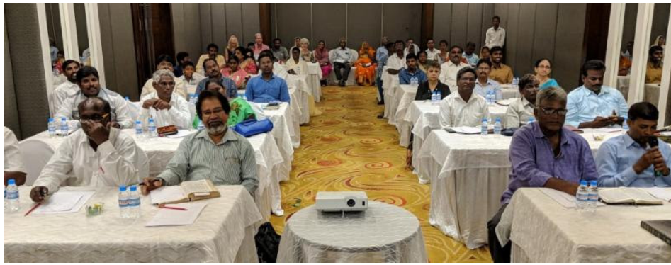
Beyond Today seminar attendees in Vijayawada, India.

From there we flew to India, first to Vijayawada and then to Visakhapatnam. Then drove to the village of Anakapalle outside of Visakhapatnam. We held Beyond Today seminars in all three places with attendances of 55, 54 and 55, respectively.