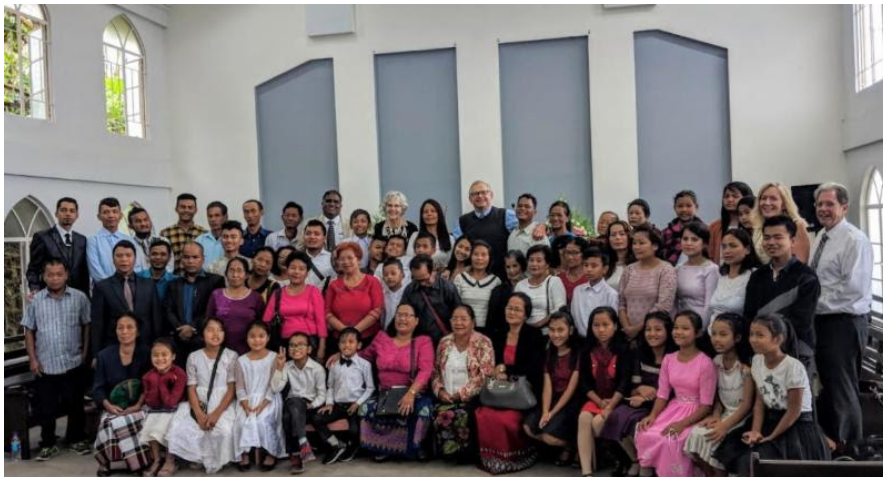
Members of the congregation in Kolasib, Mizoram.

They call themselves the United Church of God. The Council of Elders wrote a letter to them in January of this year acknowledging that "United Church of God, Mizoram" has adopted the UCGIA Fundamental Beliefs, is keeping the seventh-day Sabbath and God's Feasts and, in most other ways, is showing a desire at a future date to become a part of UCGIA, rather than just a separate church of God that is working with us. For now, we will continue our close working relationship with the United Church of God, Mizoram, as we jointly preach the gospel in the state of Mizoram.