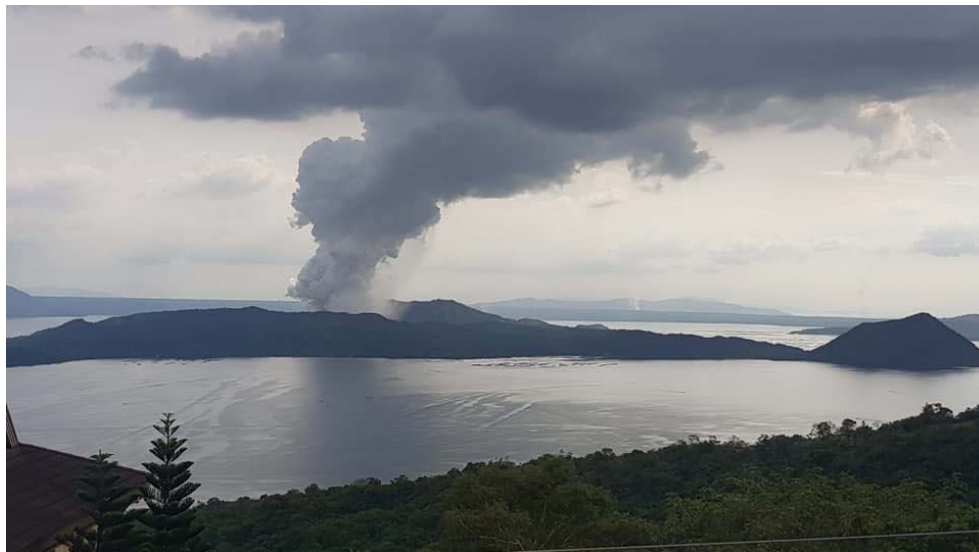
Taal Volcano.