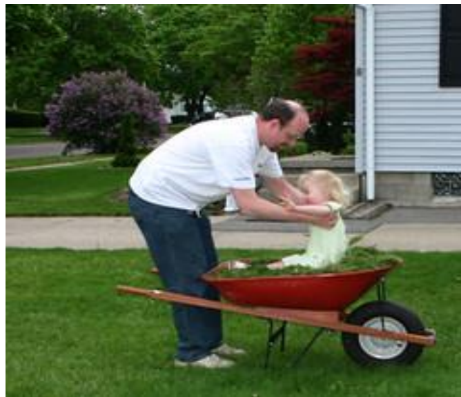
"In She Goes"

In I Corinthians 10:13 God says He will never place in front of us a challenge that we cannot handle (with His help, of course). But it is indeed possible for us to neglect God as well as His help. . . and, without God’s help we could fall off of the tightrope.