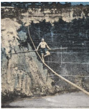
NY Public Library – all 3

"Niagara Falls 2" by trailscape, CC BY-NC-ND 2.0 "Canadian side of the Niagara falls" by mith_y, CC BY-NC-SA 2.0