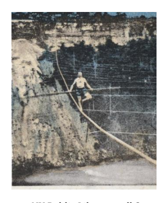
NY Public Library – all 3

"Niagara Falls 2" by trailscape, CC BY-NC-ND 2.0 "Canadian side of the Niagara falls" by mith y, CC BY-NC-SA 2.0