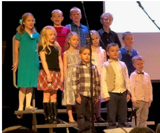
Dallas Children's Choir