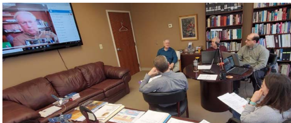
Feast Coordinator Conference