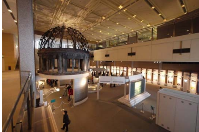
Genbaku Dome inside the Hiroshima Peace Memorial Park.

The Hiroshima Peace Memorial Park is a place almost all Japanese have visited, as well as travelers from all over the world who come and reflect on what happened.