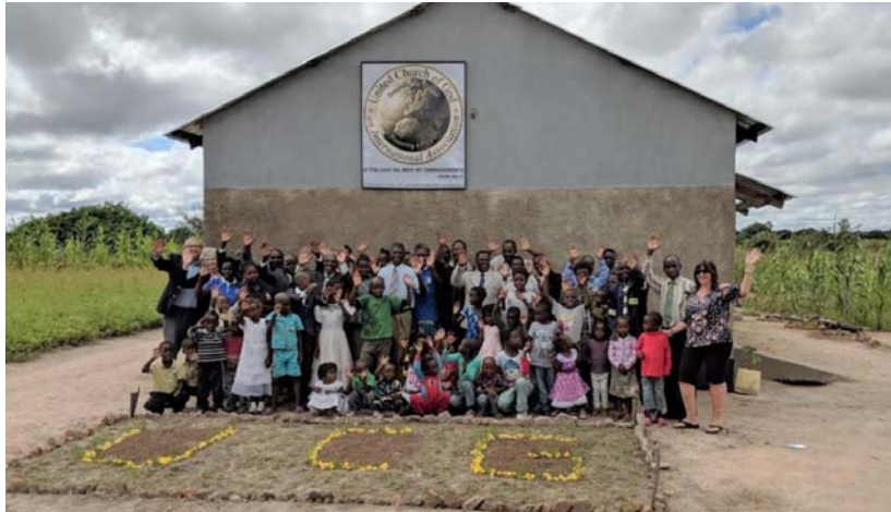
The new Mufumbwe church building and congregation on our visit, April 22, 2018.

In the past few years, the four churches along the Copperbelt have each constructed a building. The churches are growing. One of the deacons in Solwezi has been doing a program on the radio.