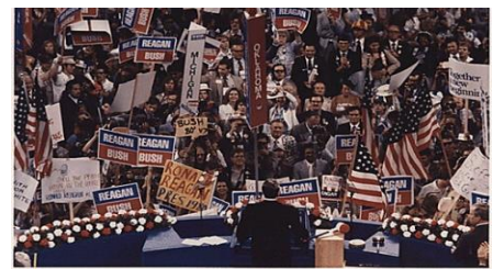
Peace through strength