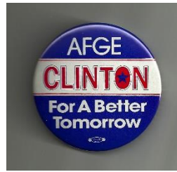
Bridge to 20 th Century