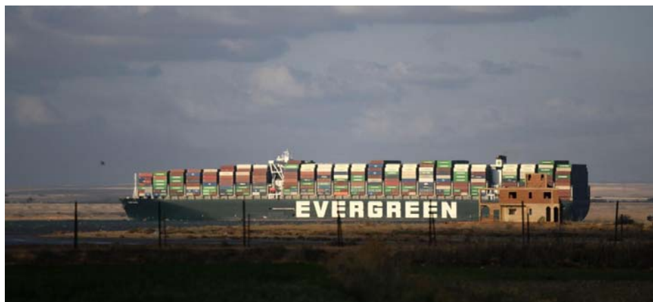
The Ever Given in the Suez Canal (Photo by CHINE NOUVELLE/SIPA/Newscom).

Longer than the Empire State Building is tall and weighing more than 200,000 tons, the massive Evergreen container ship Ever Given had wedged itself sideways in a narrow section of the Suez Canal. Hundreds of ships were blocked from passing through the Egyptian sea gate. For six long days, various tugboats yanked and pulled, trying unsuccessfully to break free the mammoth-size vessel.