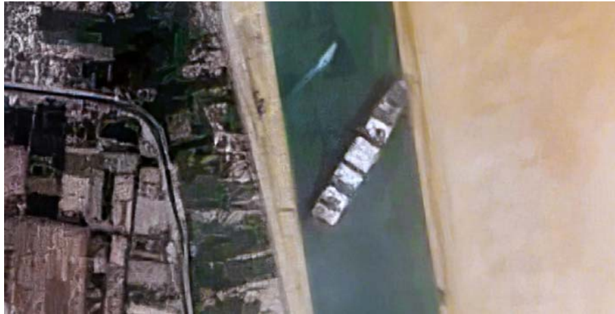
The Ever Given blocking the Suez Canal (photo by Wikimedia).

Finally, as one news source described it, “a piece of celestial good luck”—an unusual high tide that topped out a foot and a half higher than normal—helped engineers break loose the 1,300-foot vessel. The high tide was caused by the first “supermoon” of the year, so called when a full moon orbits to its nearest point to the earth.