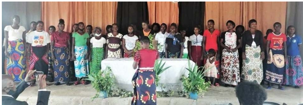
Combined women's choir singing special music at the new Madzimawe hall for Spring Holy Day Services.

This involved preaching on the radio, and holding Bible studies and church services. It also involved seminars and lectures on conservation farming and entrepreneurship with focus on women. This is a very poor area and we have helped the community with food security, water, livestock and homes. Since 2018, the brethren have built two church buildings and are working on a third one now.