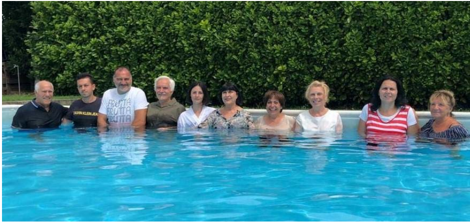
On Sunday, July 25, eight new people were baptized in Sirmione, Italy. Two more were baptized by Angelo Di Vita.

“I am pleased to inform you that on July 25, 2021, our Lord has added ten more new members to His Church in Italy. Last year, we had nine baptisms. These new members were aided by Facebook and more than 120 video sermons published on our YouTube channel LaBuonaNotiziaTV.