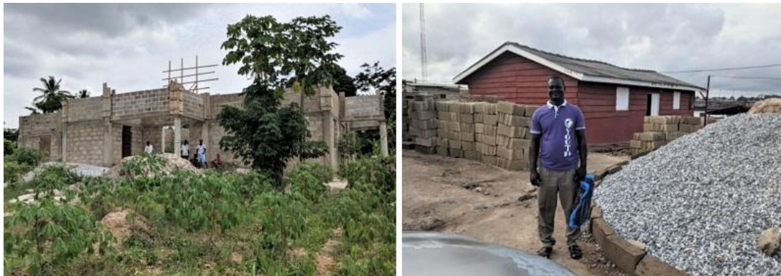
Kwanyako and Winneba church buildings and community centers.