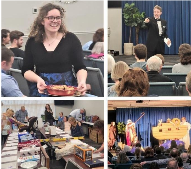
Photos from the 2022 ABC Charity Auction.

(including large flat screen TVs)—was combined with live auction breaks between the musical presentations and entertaining acts (including a fractured sendup of Goldilocks and the three bears, and an amusing “mashup” of the Genesis flood and the Red Sea exodus) performed by ABC students. A wide variety of high-quality baked goods provided by area members were auctioned off.