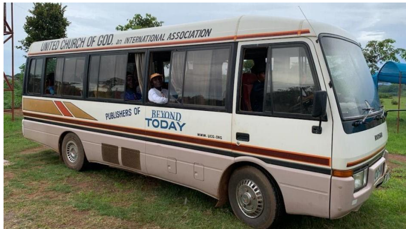
The bus being replaced in Mufulira, Zambia.

“Going once, going twice, sold!” Amidst laughter, good-natured bidding and fellowship, 16 Ambassador Bible College students outdid themselves with humor and creativity as Church members and families returned in force Sunday, March 20, to the Church’s main facility in Milford, Ohio. The event, titled “Return to the Theatre,” was the first in-person ABC Fun Charity Auction since COVID-19 restrictions were imposed, and laughter abounded with the skits and auction breaks. The event was also streamed live. To date, the event has raised an amazing $9,500 to purchase a church bus for the United Church of God congregation in Mufulira, Zambia.