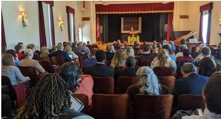
Last Day of Unleavened Bread in Hartland, Michigan.