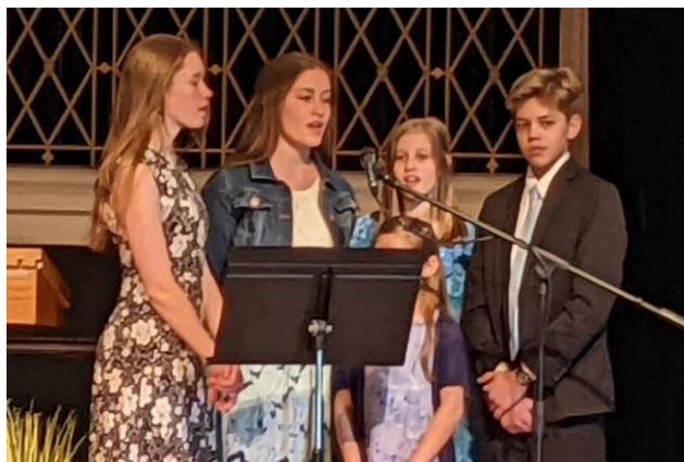
Special music performance on the Last Day of Unleavened Bread.

All the messages were encouraging and uplifting, despite the difficult times in which we live. Like you, I am truly hopeful we have seen the worst of the pandemic and its affect will continue to lighten progressively. I suppose we might be a bit naïve to think we are completely past any significant issues with COVID-19, but certainly things have greatly improved. I know we are all truly thankful to God for this relief. It is very good to see more and more people physically returning to church services and to fellowship with our brethren.