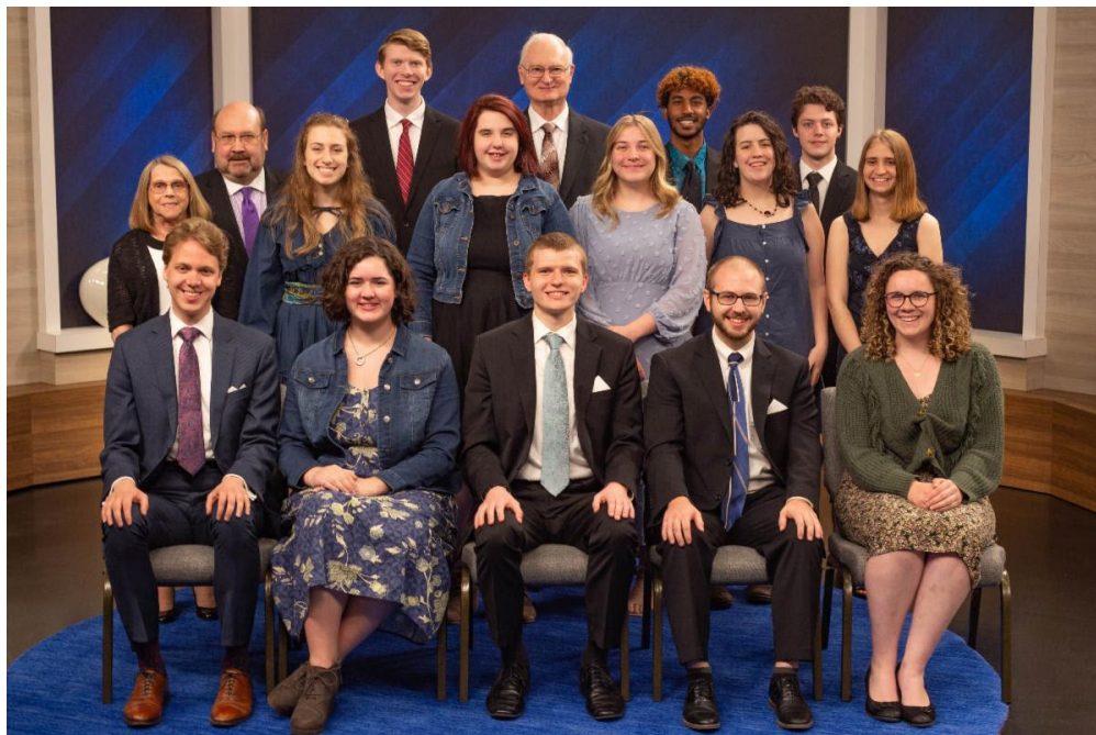
Ambassador Bible College Class of 2022

In a few days I will preside over the 23 rd graduation ceremony for Ambassador Bible College, for the Class of 2022. (Sunday, May 8, beginning at 11 a.m. EDT, you can watch it live online at abc.ucg.org/webcast/graduation-2022 )