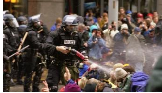
A future without disunity