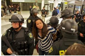
A future without chaos