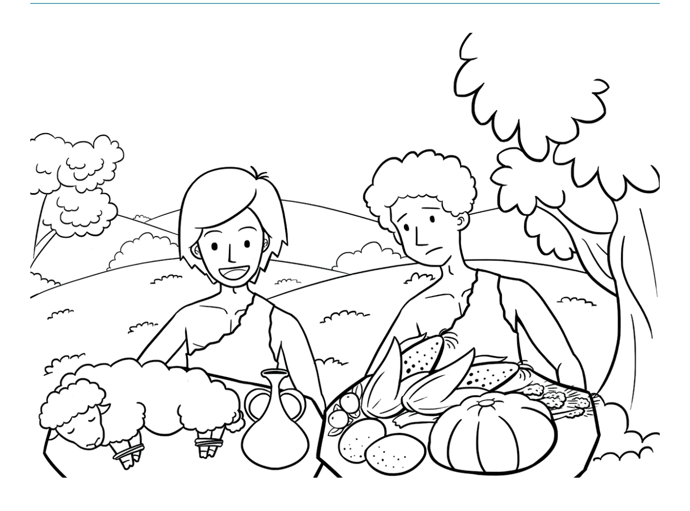
True or False?

Circle "TRUE" if the sentence is correct and "FALSE" if it is wrong.