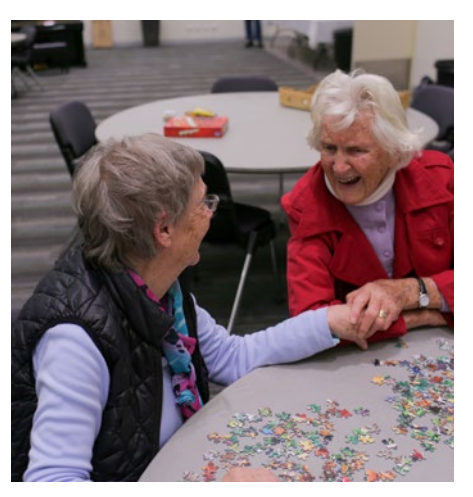
Rockingham, Western Australia