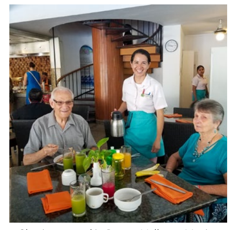
Sharing a meal in Puerto Vallerta, Mexico