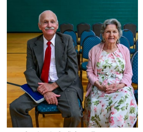
Services in Gatlinburg, Tennessee