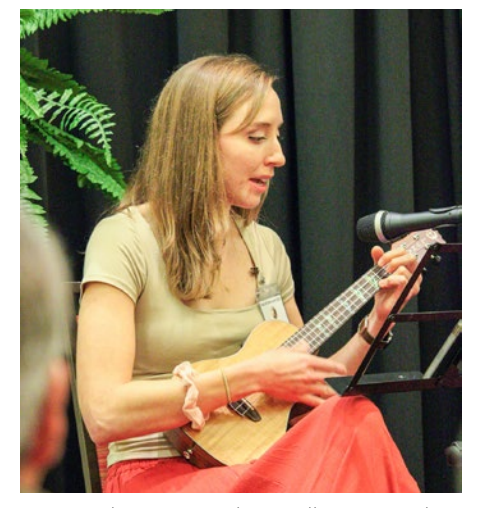
Special Music in Calgary, Alberta, Canda