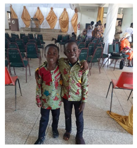
Children at the Feast in Ghana

Features: a, ac. Prices are per room, per night. All rooms include their own toilet and bathroom. Executive matrimonial room includes hot and cold showers.