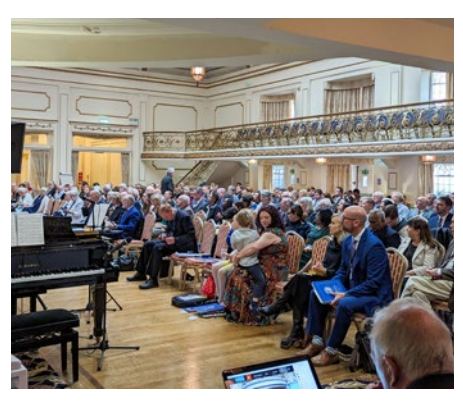
Southport, British Isles

Along the coast, around 17 miles south of Southport, lies the city of Liverpool, which from Southport is readily accessible, either by car or public transport. Liverpool contains many tourist attractions, including museums, art galleries, the Albert Docks and the Liverpool One shopping precinct.