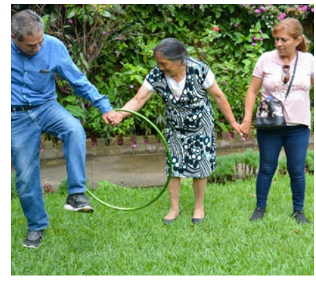
Team building in Panajachel, Guatemala

cooked meals provided except on the Sabbath. International visitors will lodge in good hotels about a 30-minute drive from the Feast site or can stay on-site with the brethren.