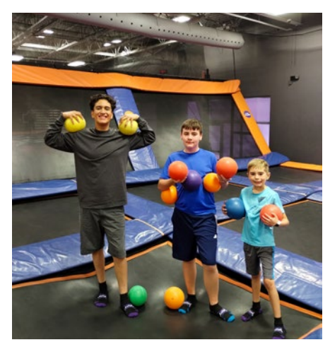
Youth activities in Cincinnati, Ohio

Features: ac, fw, h, hr, kq, l, most units are around 40- to-45 minute drive from site. Rates available one day before and after the festival term.