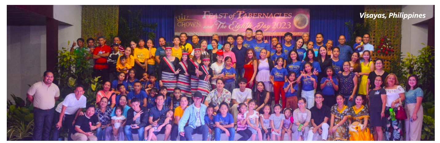
Festival Planning Brochure 2024