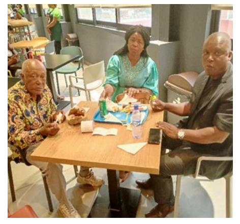
Sharing a meal in DR Congo

warm ocean water and numerous activities within the hotel, among many other things. If the room block is met, the hotel will be exclusive for our group, making it an ideal Feast for families with children and teens. Translation into English will be available during the services.