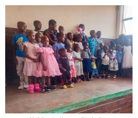
Children's Choir in Zimbabwe

the base of the tower or enjoy rock climbing with a permit.